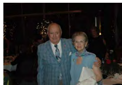
Dance the night away